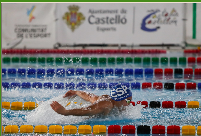
Piscina Municipal Olímpica de Castellón 50 m - 10 lines. Omega Quantum

The organizing committee of XVIII Trofeo Internacional Castalia Castellón is honored to invite you to participate on the first stage of the Spanish National Circuit. We will be pleased to welcome you to our fantastic 50 m. pool and we hope TICC 2022 will exceed your expectations.