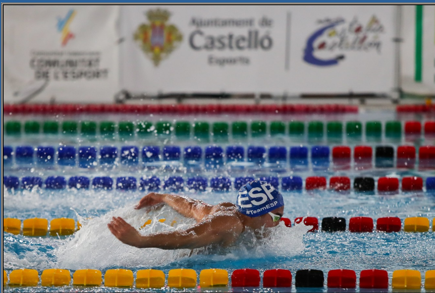
Piscina Municipal Olímpica de Castellón 50 m - 10 lines. Omega Quantum IV GRAND PRIX -LEN

The organizing committee of XVIII Trofeo Internacional Castalia Castellón is honored to invite you to participate on the first stage of the Spanish National Circuit. We will be pleased to welcome you to our fantastic 50 m. pool and we hope TICC 2021 will exceed your expectations.